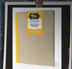
Frukt bespoke book