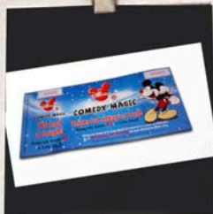
Comic Relief & Disney raffle tickets