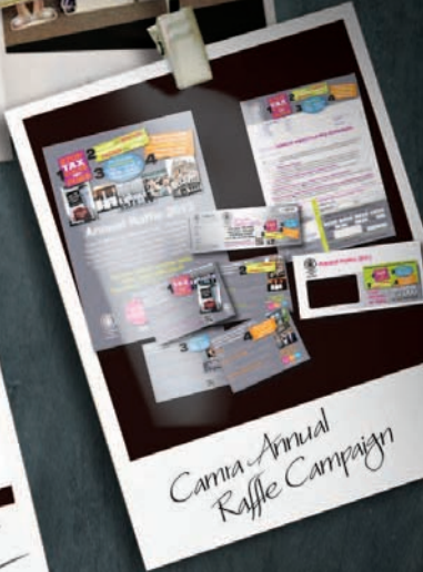
Carma Annual Raffle Campaign