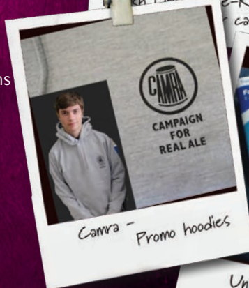
Camra - Promo hoodies