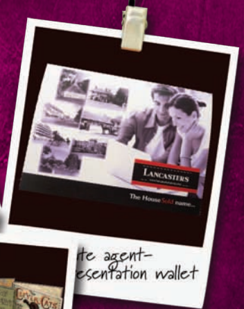
the agent- presentation wallet