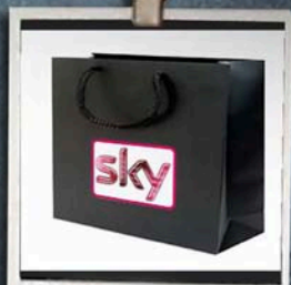
Sky luxury rope handle bags