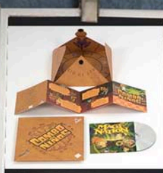
Disney CD set