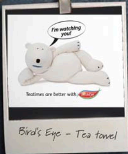
Bird's Eye - Tea towel