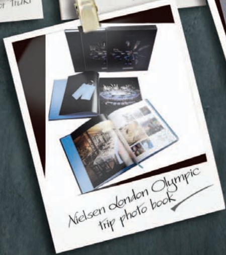
Nielsen London Olympic trip photo book