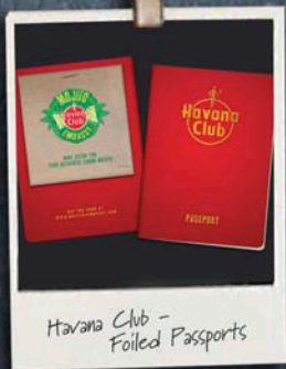
Havana Club - Foiled Passports