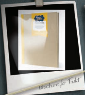
brochure for Fruit