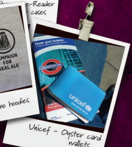
Unicef - Oyster card wallets