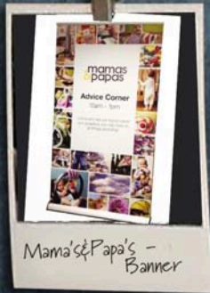
Mama's & Papa's - Banner