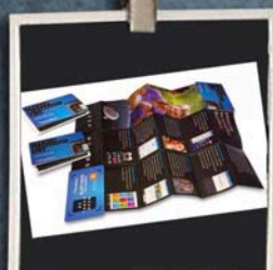
BlackBerry 'Z'-folded leaflet