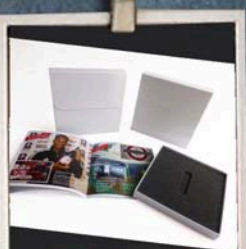
Octagon box wallet