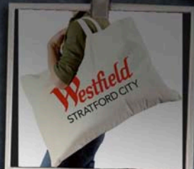
Westfield cotton shoppers