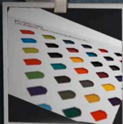
Die-cut BPI booklet