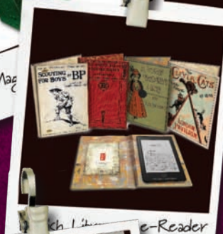
Kh. L. it... e-Reader cases