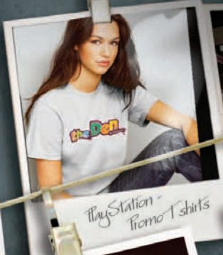
PlayStation - Promo T-shirts