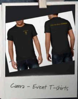
Camra - Event T-shirts