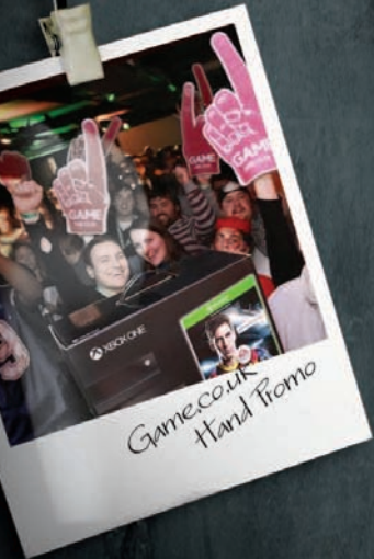
Game.co.uk Hand Promo