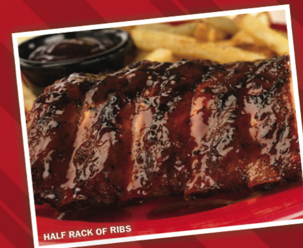
HALF RACK OF RIBS