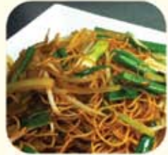
Fried Noodles with Spring Onion