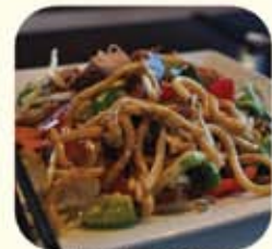
Pork with Japanese Udon Noodles