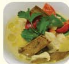
Chicken in Thai Green Curry