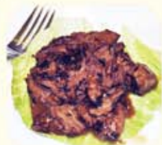
Beef in Korean Style