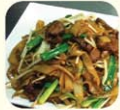
Beef Kwai Toew