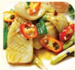
Thai Chilli Squid