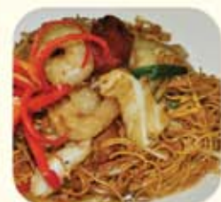
Yung Chow Chow Mein