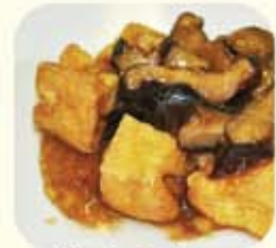
Shiitake Mushroom with fried Tofu