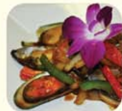
Mussels in Hoi Sin