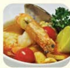
Tom Yum Goong