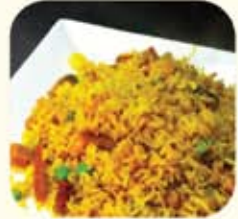
Singapore Fried Rice