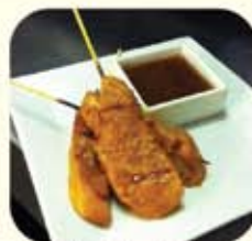
Malaysian Chicken Skewers