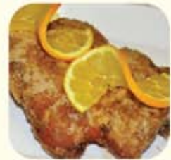
Duck in Orange Sauce

Roast Pork Foo Yung ( Chinese Scramble Egg)