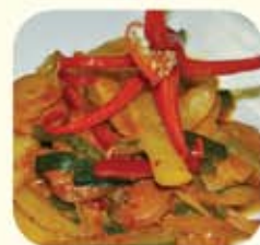
Indonesian King Prawns with Safron