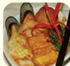
Seafood Laksa Noodles

Trio - Seafood Crispy Noodles ( Included King Prawns, Mussels, Squid )