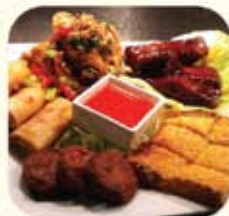
Mixed Starter Platter