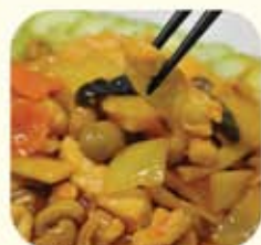
Kung Po Chicken