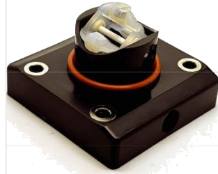
Paddle Wheel Assembly