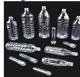
Bottle Sample Made by This Machine