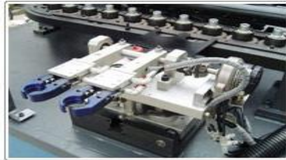
Bottle Out Unit