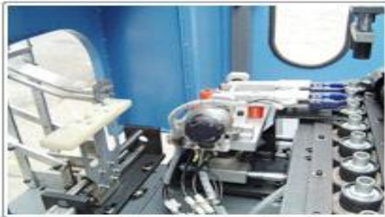
Preform autoload Unit