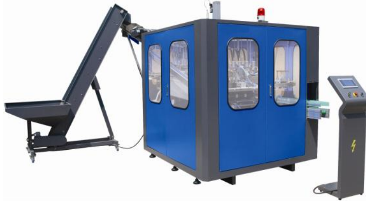
CM-A4 Automatic Blow Molding Machine