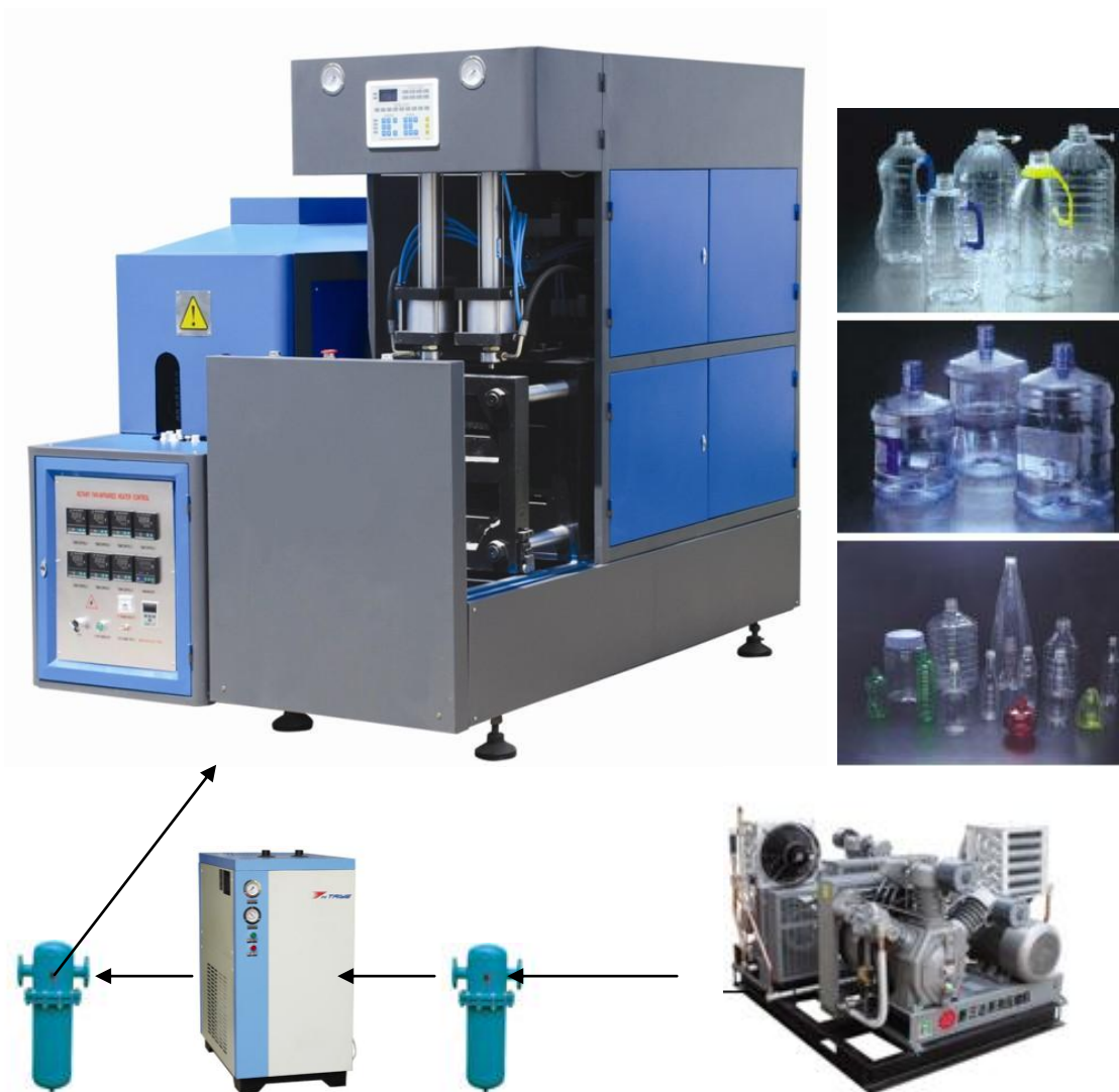
CM-9B semiautomatic Blow Molding Machine