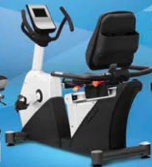
DB309 GENERATOR RECUMBENT