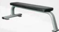
LH-C100 Flat bench