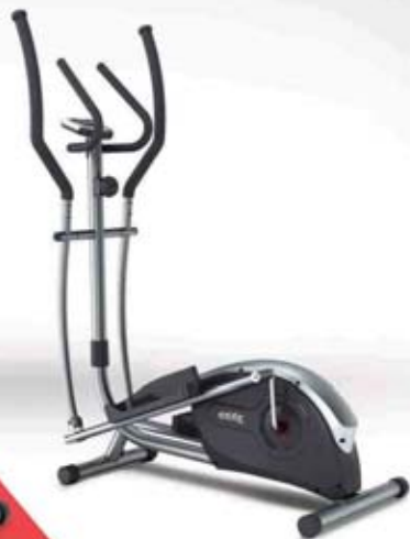
YE3.2 ELLIPTICAL BIKE