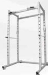
LH-B28 Squat Rack