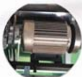
AC 4 HP