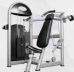
LH-C75 Shoulder Press