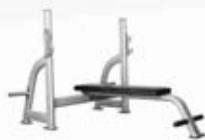
LH-C103 Olympic Flat Bench