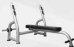
LH-B24 Olympic Flat Bench