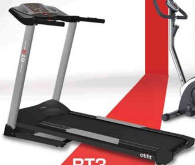
BT3 MOTORIZED TREADMILL