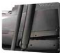
Swing arm with Built-in hydraulic

Wireless sensor detect motion to signify a change in speed