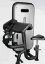
LH-B16 Bicep Curl Machine