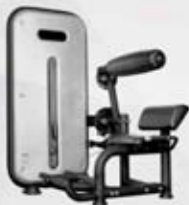
LH-B08 Back Extension