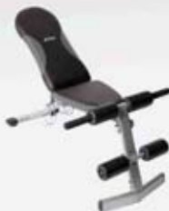
AFHW6013 Weight Bench