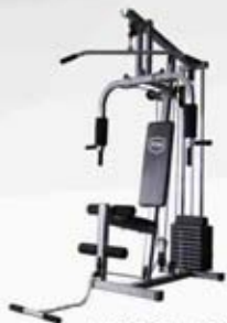
AFHG-42 Home GYM