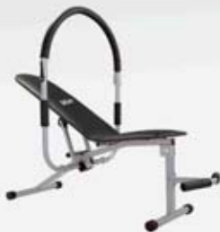
AFHG-42 Weight Bench