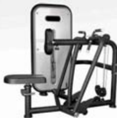
LH-B06 Seated Row