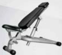
LH-B29 Multi Adjustable Bench