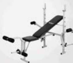
AF-309 Weight Bench