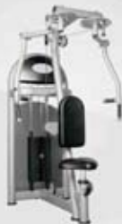
LH-C82 Seated Straight Arm Clip Chest