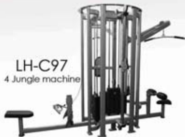
LH-C97 4 Jungle machine