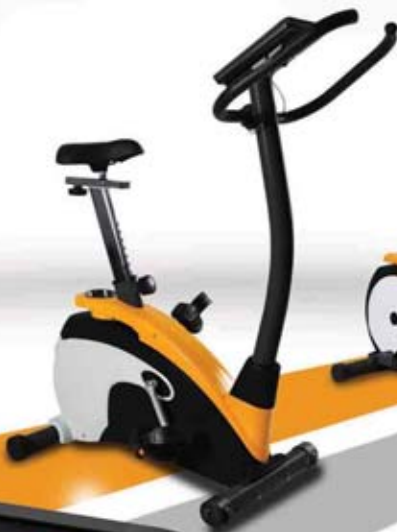
S3.3U UPRIGHT BIKE