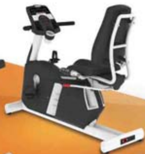
RB9.5 RECLUMBENT BIKE