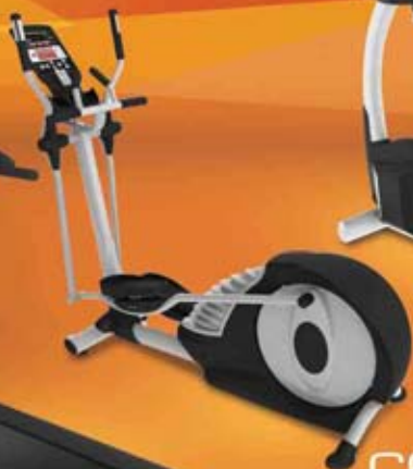
C6.4 CROSS TRAINER