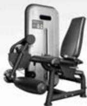
LH-B12 Leg Extension