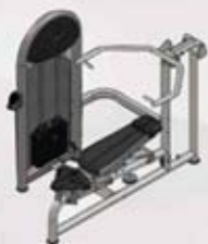
LH-C98 Multi Press