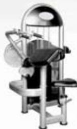
LH-C80 Triceps Press Machine