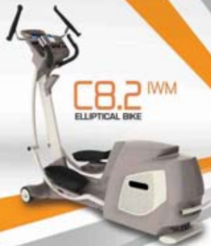
C8.2 IWM ELLIPTICAL BIKE

Server motor direct drive system 16 levels resistance 6 kgs flywheel 28kg inertia weight Patented upper body Cardio-Core motion handlebar Sure-Fit™ self-pivoting with comfortable pedals Adjustable arm Power incline to 50% Built in "ramp-less" incline 21" stride length w/ reversible elliptical motion Swing up arc motion IPOD dock with Speaker N.W. / G.W.: 102.6 / 107 kg 20" / 40" / 40"HQ : 26 / 56 / 84 sets