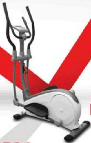
DX3.1 ELLIPTICAL BIKE