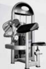
LH-C81 Bicep Curl Machine