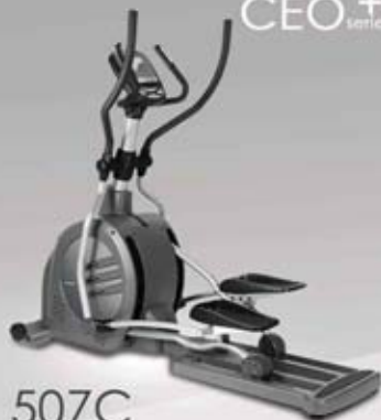
507C Cross trainer