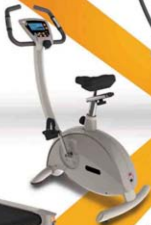
U1.7 Upright bike