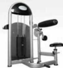
LH-C87 Abdominal Machine