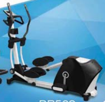
DB509 GENERATOR ELLIPTICAL