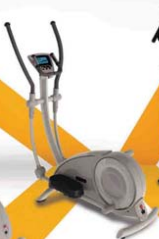
E1.7 Elliptical bike