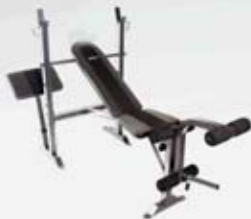
AFHW 408 Weight Bench