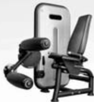
LH-B11 Seated Leg Curl