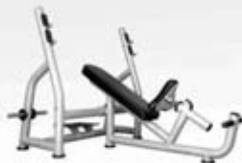
LH-B25 Olympic Incline