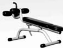
LH-B31 Adjustable Crunch Bench