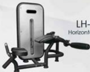
LH-B14 Horizontal Leg Curl