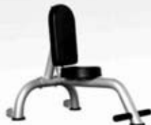
LH-B32 Utility Bench