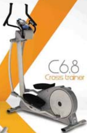
C6.8 Cross trainer