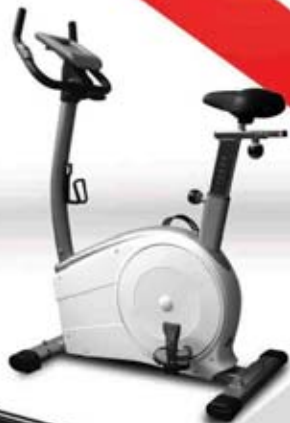
DB2.1 UPRIGHT BIKE