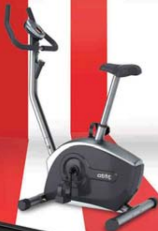
YE3.1 UPRIGHT BIKE