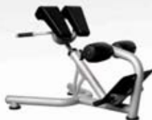
LH-B27 Roman Chair/ Back Extension Bench