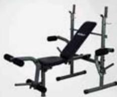
AF-380 Weight Bench