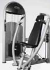
LH-C77B Converging Chest Press