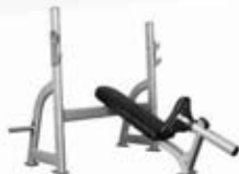
LH-C104 Olympic Incline Bench