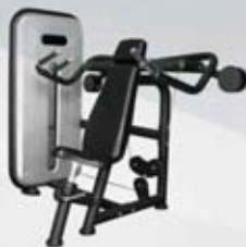
LH-B03 Shoulder Press