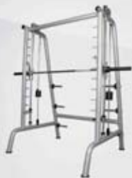
LH-B22 Smith Machine