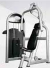
LH-C77 Seated Chest Press