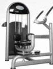
LH-C94 Rotary Torso