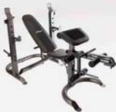
AFHW 410 Weight Bench