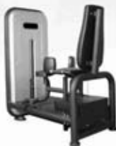
LH-B13 Outer Thigh Abductor