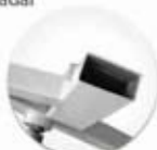
50x100x2.5 thickness tube