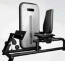
LH-B09 Leg Press