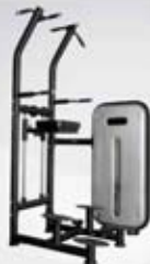
LH-B17 Upper Limbs