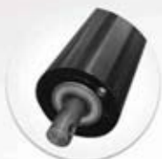
100 mm Roller