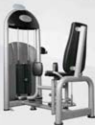
LH-C91 Inner Thigh Adductor