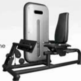
LH-B15 Seated Calf Machine