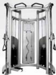
LH-B05 Dual Adjustable Pulley