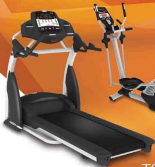
T9.5 MOTORIZED TREADMILL