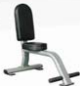
LH-C101 Utility bench