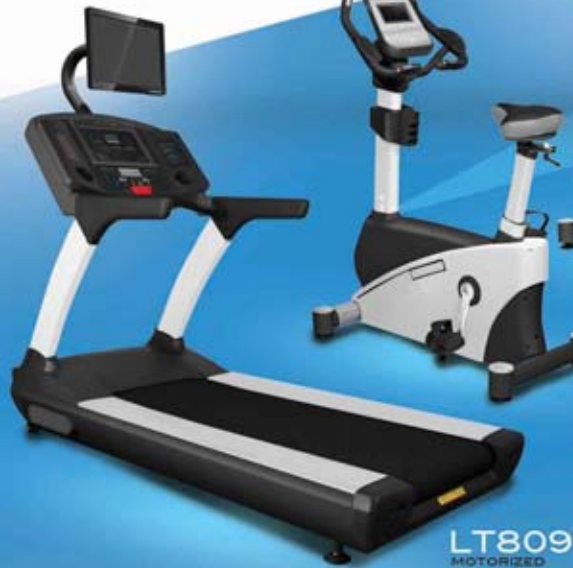
LT809 MOTORIZED TREADMILL