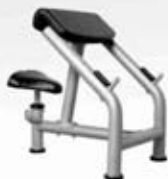
LH-B26 Preacher Curl