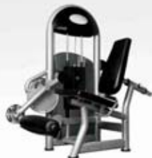
LH-C85 Leg Extension