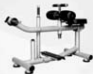
LH-B37 Seated Calf Machine