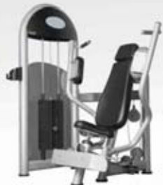
LH-C76 Butterfly / Pec Fly