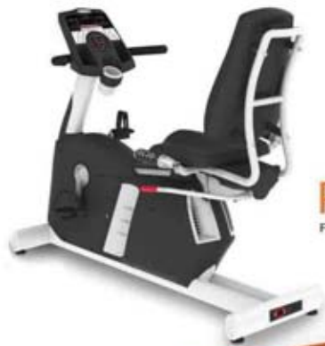
RB9.5 RECUMBENT BIKE