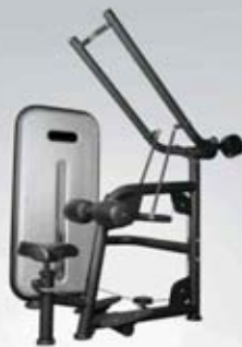
LH-B04 High Pully/ Lat Pulldown