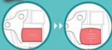
PATENT SUSPENSION SYSTEM