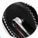
Good quality Bearing