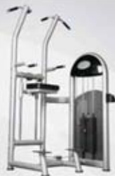
LH-C93 Upper Limbs