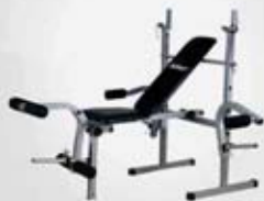
AF-307 Weight Bench