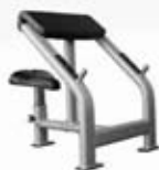
LH-C102 Preacher Curl Bench