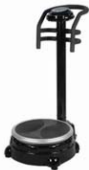
AF690 VIBRATION PLATE