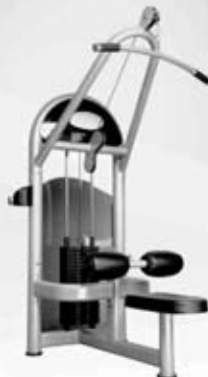
LH-C95 High Pulley / Lat Pulldown