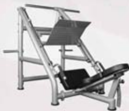
LH-C99 45 degree leg press