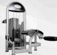
LH-C83 Horizontal Leg Curl