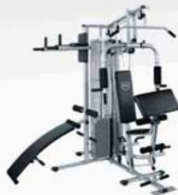
AFHG-47 Home GYM