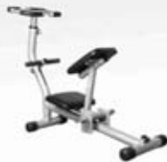
LH-B38 Draw Muscle Machine