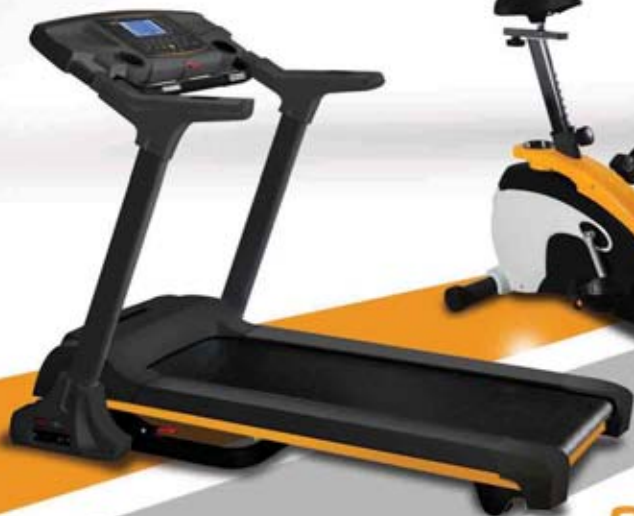
S3.3T MOTORIZED TREADMILL