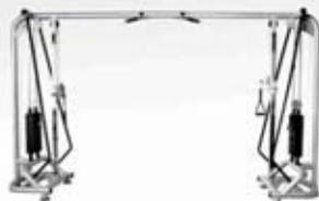
LH-B05B Cable Crossover