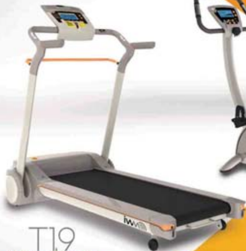
T1.9 Motorized treadmill