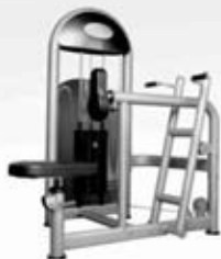
LH-C86 Seated Row