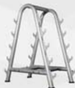
LH-B34 Barbell Rack