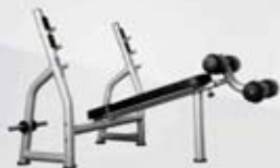
LH-B23 Decline Bench