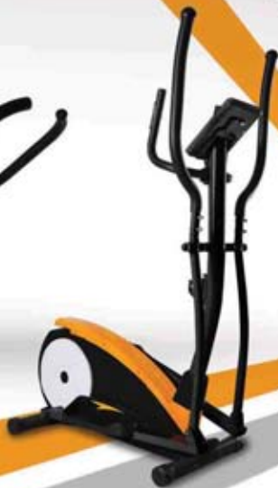
S3.3E ELLIPTICAL BIKE