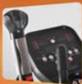
Touch thumb control

Cushion pedal fit your motion, release pressure on ankle and foot