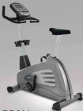
501U Upright bike