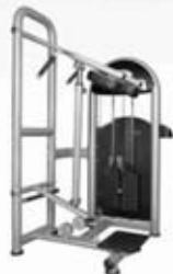
LH-C89 Standing Calf Raise