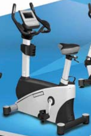
DB209 GENERATOR UPRIGHT BIKE