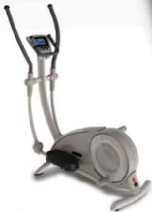
E1.7 ELLIPTICAL BIKE

Motor direct drive system 24 levels resistance 4.2 kgs flywheel 12.5 kgs inertia weight Single large LCD with blue back light IWM system + Scale N.W. / G.W.: 29 / 39 kg 20' / 40' / 40'HQ : 105 / 210 / 280 sets