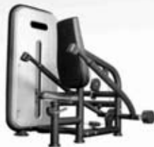
LH-B19 Tricep Press Down