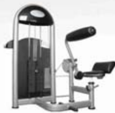
LH-C88 Back Muscle Machine