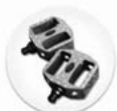
Aluminum Alloy Pedal