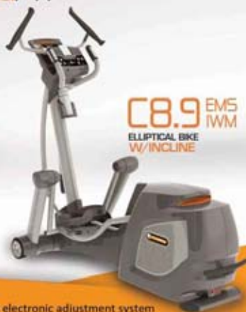
C8.9 EMS IWM ELLIPTICAL BIKE W/INCLINE

EMS electronic adjustment system 16 levels resistance 6 kgs flywheel 28kg inertia weight Patented upper body Cardio-Core motion handlebar Sure-Fit™ self-pivoting with comfortable pedals Built in "ramp-less" incline Adjustable arm Power incline to 50% Variable stride length from 18" to 28" w/ reversible elliptical motion Swing up arc motion IPOD dock with Speaker IWM system + Scale N.W. / G.W.: 103.4 / 116.6 kg 20" / 40" / 40"HQ : 26 / 56 / 84 sets