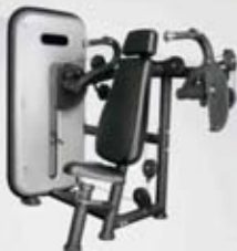
LH-B07 Triceps Press