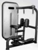
LH-B10 Rotary Torso