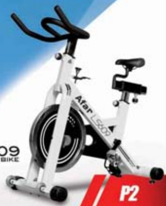
LS609 SPN BIKE