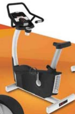
UB9.5 UPRIGHT BIKE