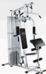
AFHG-43 Home GYM