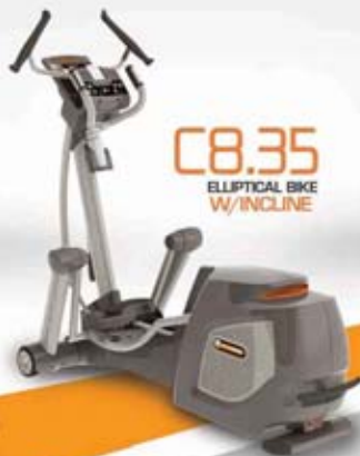
C8.35 ELLIPTICAL BIKE W/INCLINE

EMS electronic adjustment system 16 levels resistance 6 kgs flywheel 28kg inertia weight Patented upper body Cardio-Core motion handlebar Sure-Fit™ self-pivoting with comfortable pedals Built in "ramp-less" incline Adjustable arm Power incline to 50% Variable stride length from 18" to 28" w/ reversible elliptical motion Swing up arc motion IPOD dock with Speaker IWM system + Scale N.W. / G.W.: 103.4 / 116.6 kg 20" / 40" / 40"HQ : 26 / 56 / 84 sets