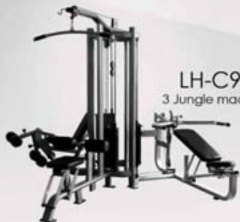
LH-C96 3 Jungle machine