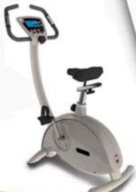
U1.7 UPRIGHT BIKE