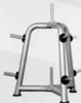
LH-B33 Weight Plate Tree