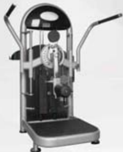
LH-C90 Multi Hip