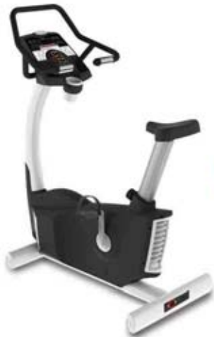
UB9.5 UPRIGHT BIKE