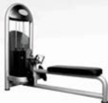
LH-C79 Horizontal Pulley