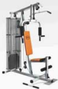
AFHG-42B Home GYM