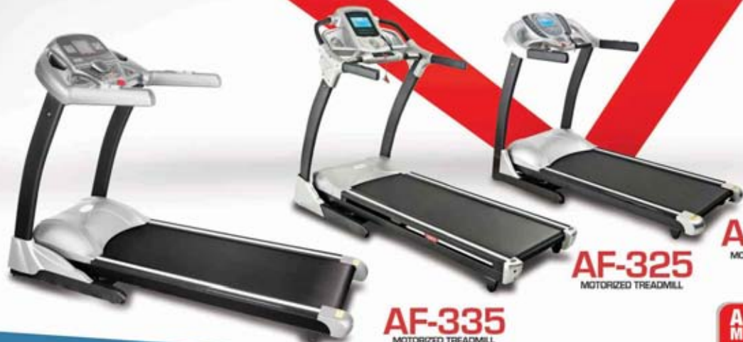
AF-322 MOTORIZED TREADMILL