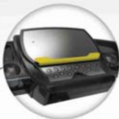
CONSOLE WITH i PAD HOLDER