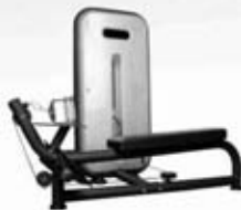
LH-B18 Horizontal pulley