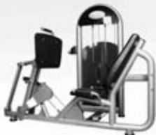
LH-C78 Leg Press