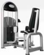
LH-C92 Outer Thigh Abductor