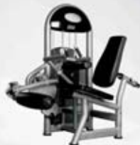
LH-C84 Seated Leg Curl