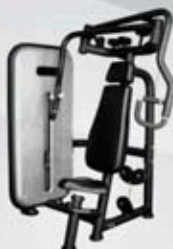
LH-B02 Seated Chest Press Machine