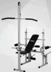
AF-307A Weight Bench