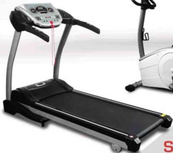
ST5.1 MOTORIZED TREADMILL