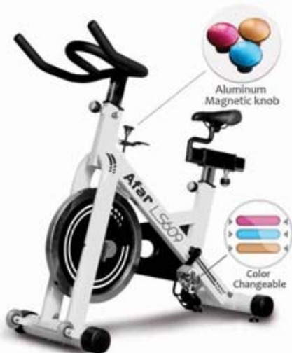
Aluminum Magnetic knob