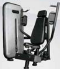
LH-B01 Butterfly/Pec fly