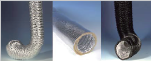
The machine also can be designed for PVC+aluminum duct

Aluminum tube is widely used in the kitchen, bathroom, air condition venting and HVAC system. The stainless steel wire inside can hold the flexible tube in shape and make the tube flexible. The new designed flexible tubeformer has a compact form and tiny oven. Easier for transport. And the glue drop system can save glue in big amount.