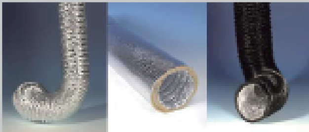
The machine also can be designed for PVC+aluminum duct

Aluminum tube is widely used in the kitchen, bathroom, air condition venting and HVAC system. The stainless steel wire inside can hold the flexible tube in shape and make the tube flexible. The latest aluminum tubeformer can make the quality aluminum flexible duct, and also we can make the insulation for protecting heat.