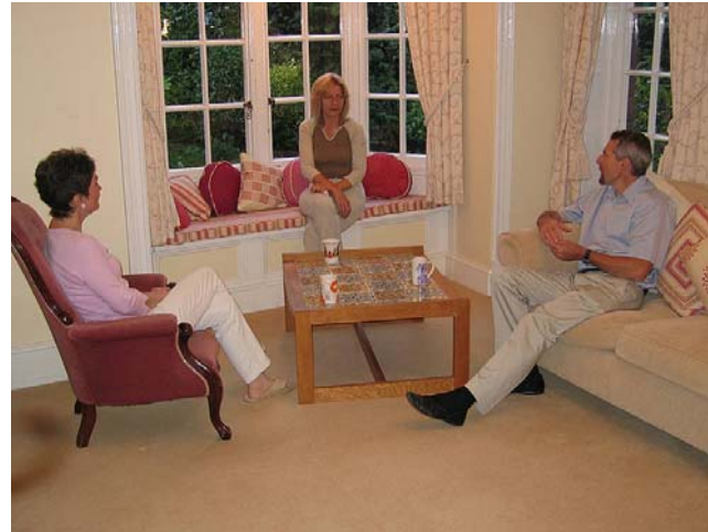
Tea and conversation with a host family

The standard accommodation arrangement is a single room with a private bathroom for your exclusive use, and includes breakfast and dinner. They are normally located a short distance from the city centre or school and also have internet access. This is the best way - even for adults - to practise their new language skills on a daily basis.