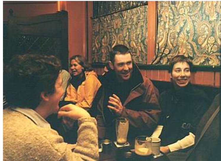
At the pub with the teacher after lessons

After an intense day of study you can experience the sights and attractions of Dublin at first hand - a beer with other course participants in a typical Irish pub, or an evening at the theatre or cinema organised by the school staff. There is also a wide range of cultural activities, such as world-class museums and exhibitions, traditional Irish music concerts, or maybe even a trip into the beautiful countryside during the weekend.