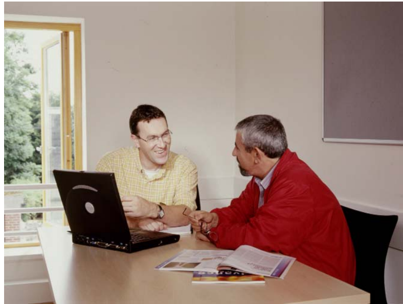
An individual lesson with the teacher

The native English teachers try to reduce theoretical explanations to a minimum, in order to encourage you to actively participate in the learning and practice process. For example, a group lesson can include a debate on common business interests while an individual lesson can focus on a job interview role-play or the analysis of an industry-specific article. Case studies give you the opportunity to work on different projects together with other course participants. By researching, discussing and working as a group all of your language skills are used and developed.