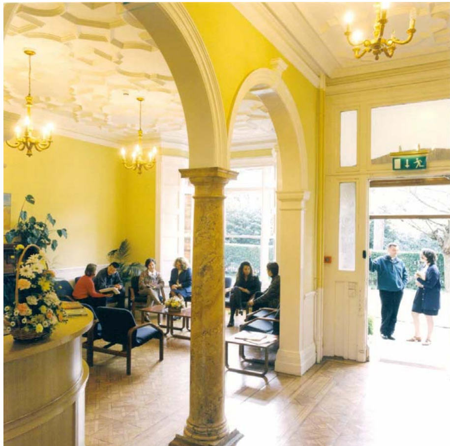
The reception area of the school

The school is located in an elegant Victorian building with its own private internal garden, situated in a charming residential area of the city with easy access to the centre of Dublin. You have access to an excellent range of didactic facilities that will help you make the most of your course and learning experience. The classrooms are fitted with audiovisual equipment and the multimedia laboratory gives you access to a range of video simulations and additional learning activities. The library contains books and materials to help you improve your business English and for enjoyment. The student lounge provides an ideal setting to relax between lessons with a newspaper and a nice cup of coffee or tea.