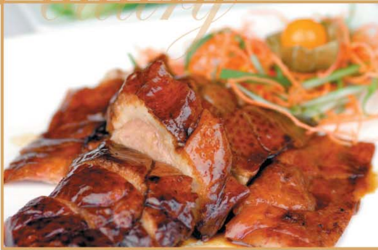
1334 明爐燒鴨 £10.20 Roast Duck Cantonese Style