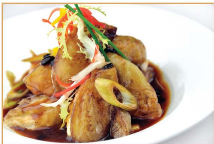
1394 豉汁煎釀茄子 £10.20 Pan-fried Stuffed Egg Plant with Minced Shrimp in Black Bean Sauce