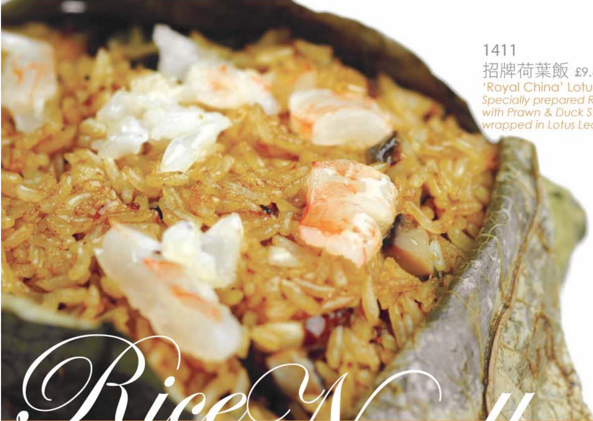
1411 招牌荷葉飯 £9.60 'Royal China' Lotus Leaf Rice Specially prepared Rice with Prawn & Duck Steamed wrapped in Lotus Leaf