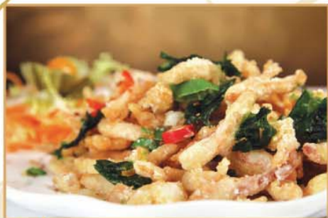
燻雞絲 Spicy Smoked Shredded Chicken £6.50