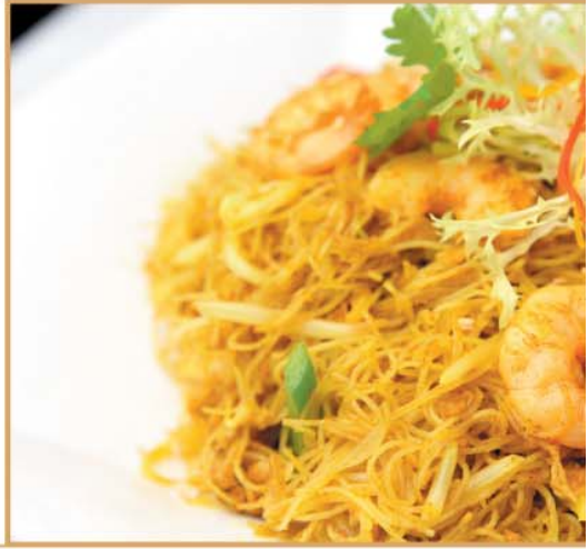
1418 星洲炒米 £8.60 Singapore Rice Vermicelli