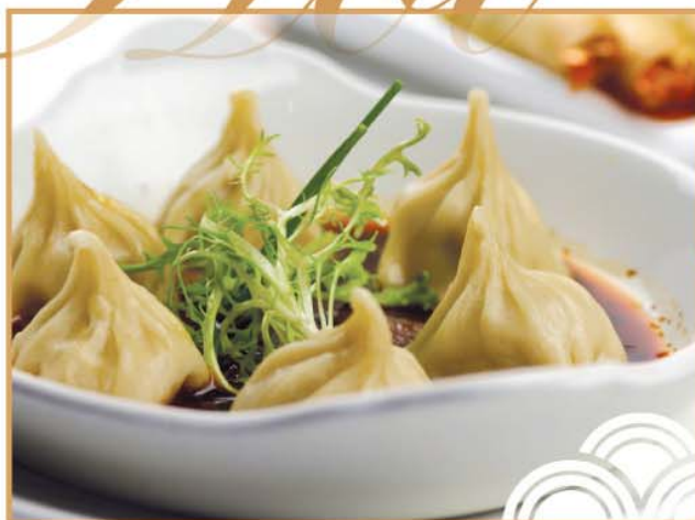
1247 紅油餃子 £6.20 Steamed Chilli Pork Dumplings