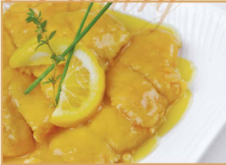
1326 西檸煎軟雞 £8.80 Lemon Chicken