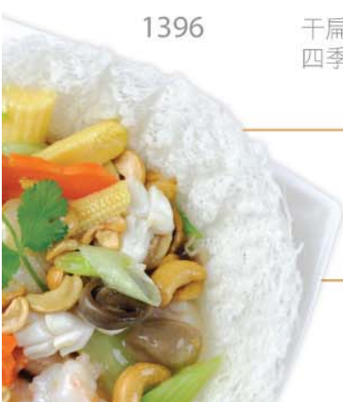
1393 鵲巢海中寶 £12.50 Sautéed Assorted Seafood in Bird's Nest