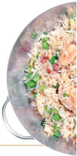
1415 楊州炒飯 £8.60 'Yeung Chow' Fried Rice with Roasted Pork and Shrimp