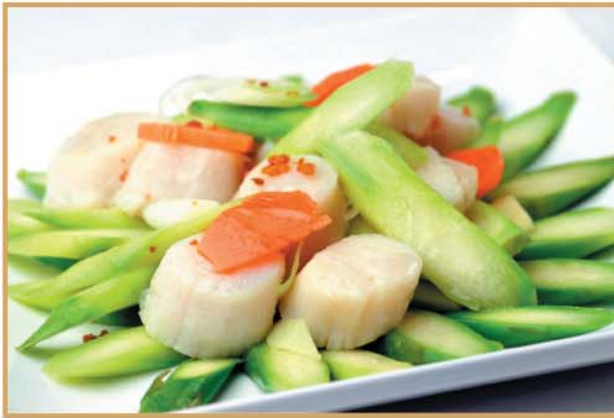
1297 鮮露筍帶子 £11.90 Sautéed Scallops with Fresh Asparagus