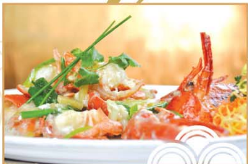
薑蔥生猛龍蝦 Ginger & Spring Onion Fresh Lobster Seasonal Price