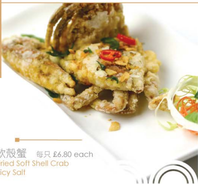
1237 椒鹽軟殼蟹 每只 £6.80 each Deep Fried Soft Shell Crab with Spicy Salt