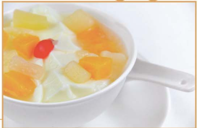
1432 雜果豆腐花 £4.50 Almond Tofu with Fruit Cocktail