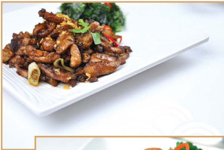
1331 潮式川椒雞 £9.50 Chicken with Chilli in 'Chiu Chow Style'