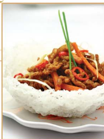
鵲巢牛柳絲 Crispy Shredded Beef Served in Bird's Nest £8.80