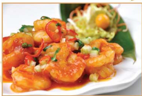
四川蝦 Sautéed Prawn with Red Chilli Sauce 'Szechuan Style' £11.90