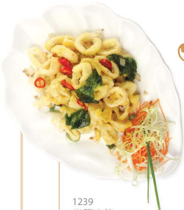
1239 椒鹽吹筒 £6.50 Deep-fried Baby Squid with Spicy Salt