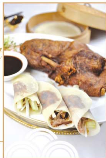
香酥鴨 Crispy Aromatic Duck £22.00