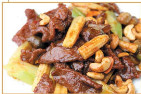
1345 腰果牛肉 £8.80 Beef with Cashew Nuts