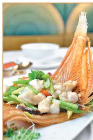
椒鹽龍利球 Stir-fried or Deep-fried Fillet of Dover Sole with Spicy Salt Seasonal Price