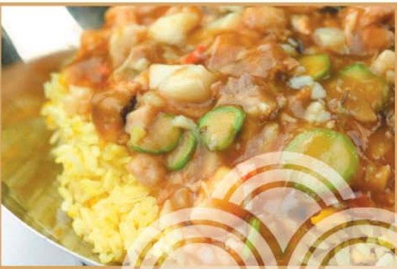
1412 福建炒飯 £9.60 Fukien fried Rice Egg Fried Rice Topped with Creamy Assorted Seafood & Chicken