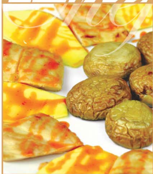
1397 泰式香芒雞 £10.20 Chicken with Fresh Mango