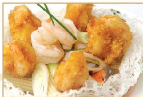
鵲巢金銀蝦 Crispy Fried & Braised Prawn Served in Bird's Nest £11.90