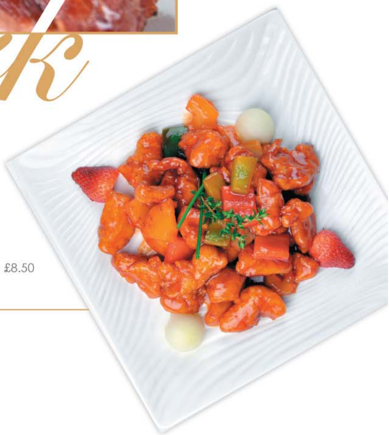
1351 菠蘿咕嚕肉 Sweet & Sour Pork