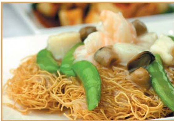
1419 三鮮炒麵 £9.60 Seafood fried Noodles (Crispy / Soft)