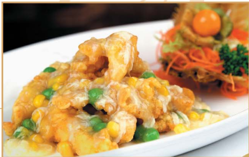
1310 粟米燴魚塊 £19.00 Deep-fried Fillet of Dover Sole with Creamy Sweet Corn Sauce