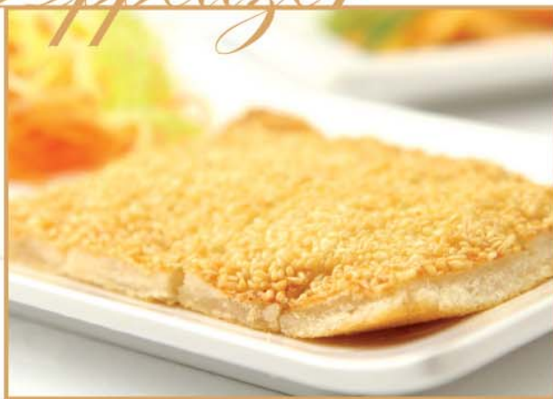
1232 芝麻蝦 £6.80 Sesame Prawn Toast