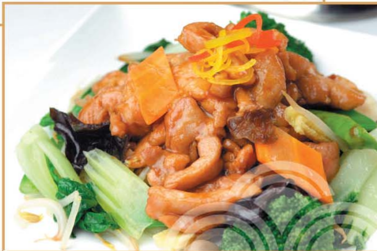
1332 素菜炒雞柳 £8.80 Sautéed Chicken with Mixed Vegetables