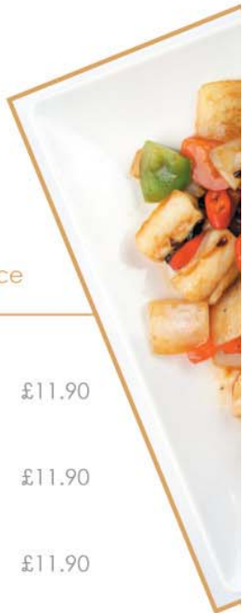
1298 豉椒炒鮮魷 £11.90 Sautéed Squid with Peppers & Black Bean Sauce