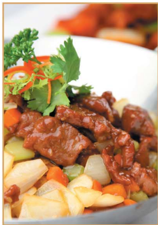
1349 燒汁牛仔粒 £12.50 Diced Veal with Teriyaki Sauce