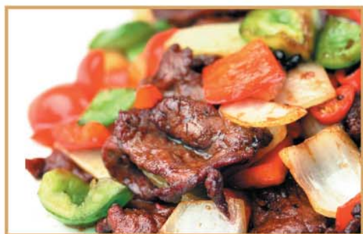
1343 豉椒牛肉片 £8.80 Sautéed Beef with Chilli & Black Bean Sauce