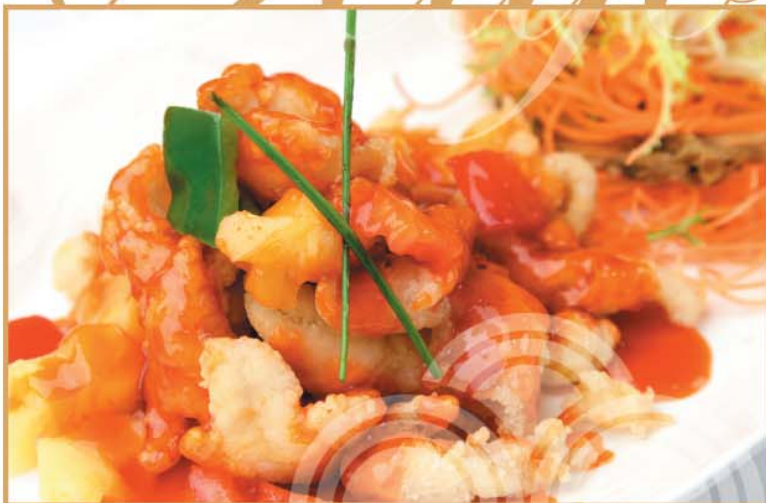
1311 咕嚕燴魚塊 £19.00 Deep-fried Fillet of Dover Sole with Sweet & Sour Sauce