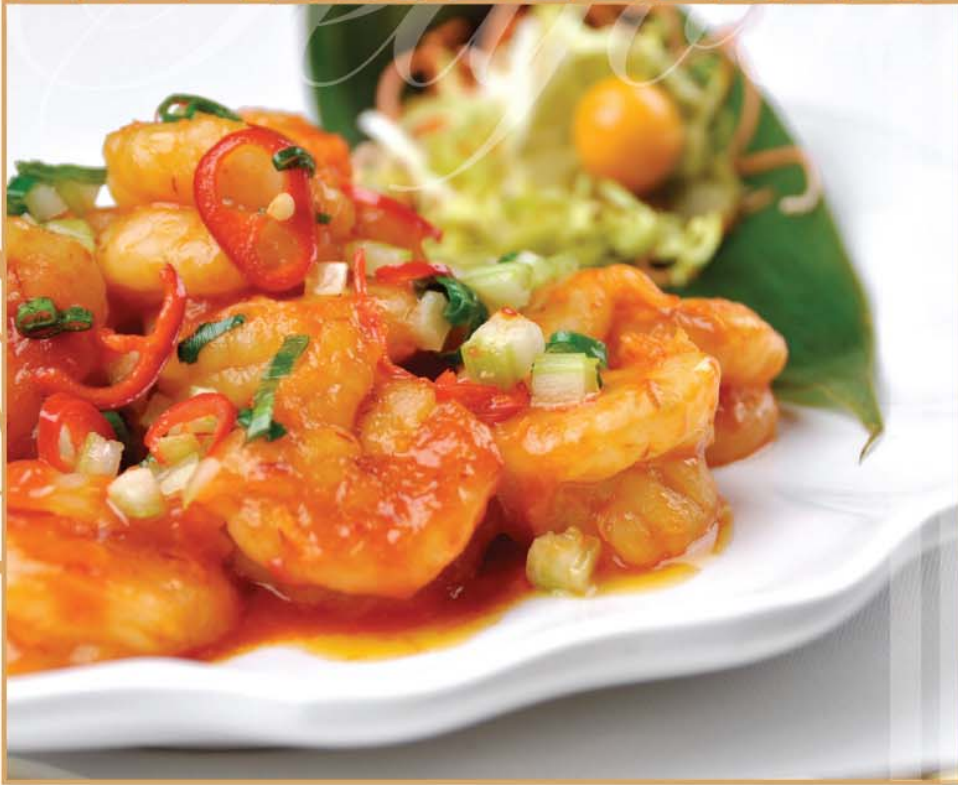
1292 四川明蝦球 £11.90 Szechuan Prawns