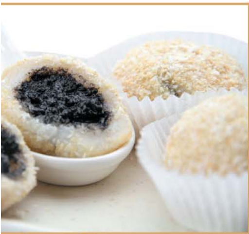
1433 擂沙湯丸 £5.00 Black Sesame Paste in Peanut Crumbs