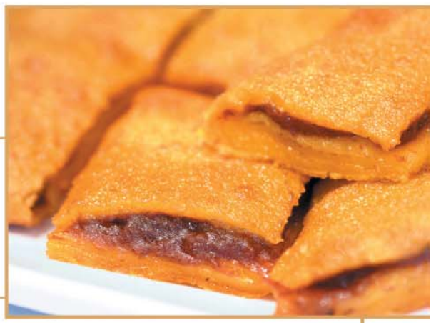
1440 豆沙鍋餅 £6.80 Pan-fried Red Bean Pastry