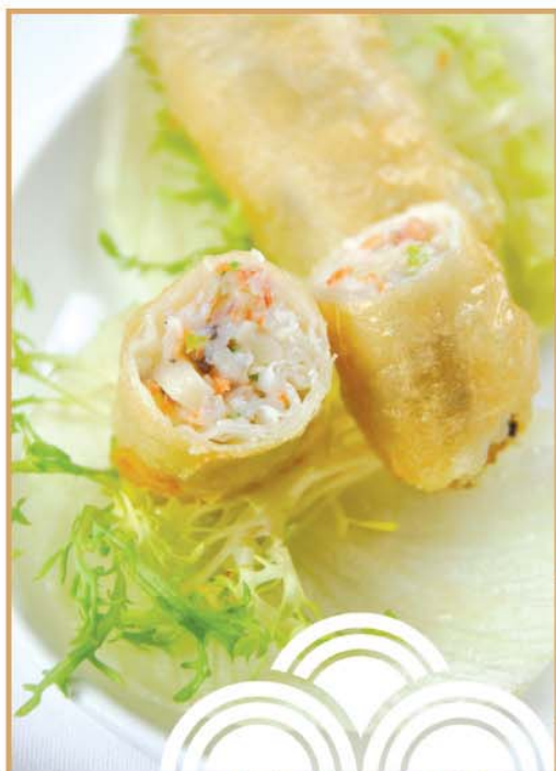
1242 越南春卷 £5.20 Vietnamese Pancake Rolls (Pork & Prawn)