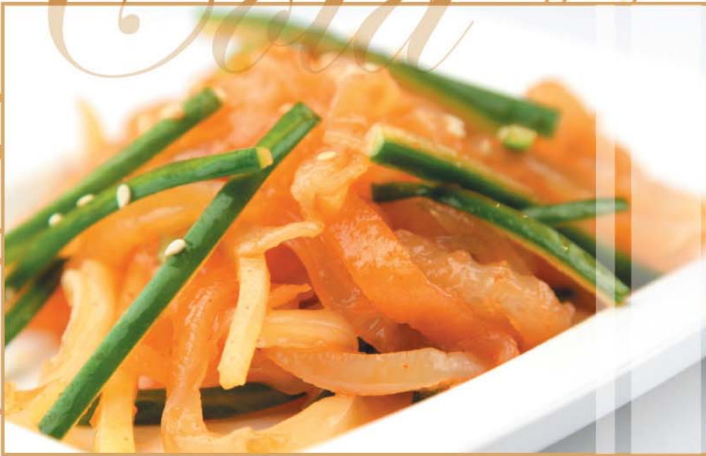
1263 青瓜海蜇 £8.00 Jelly Fish Tossed with Cucumber