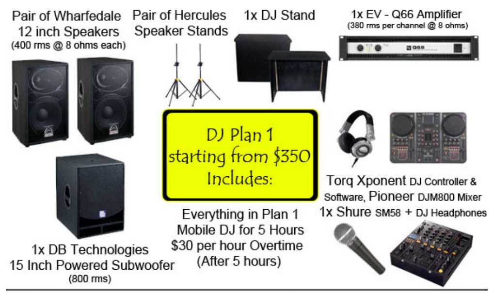
Traveling Fee's May Apply - All Damages must be Paid for - $30 per hour overtime fee after 5 hours

Mobile DJ Plan 1 : starting from $350 for 5 hours includes 2x Wharfedale LX 12 400 rms speakers at 129spl, 1x DB Tech Sub15 800 Rms Powered at 129spl, 1x EV Q66 Amp 380rms per channel, Pair of Hercule Speaker Stands, 1x Torq Xponent, 1x Pioneer DJM800, 1x Shure SM58 Mic, 1x Technic Headphones & 1x Custom DJ Stand ($30 per hour after 5 hours of DJ time, set up & pack up is not charged for)