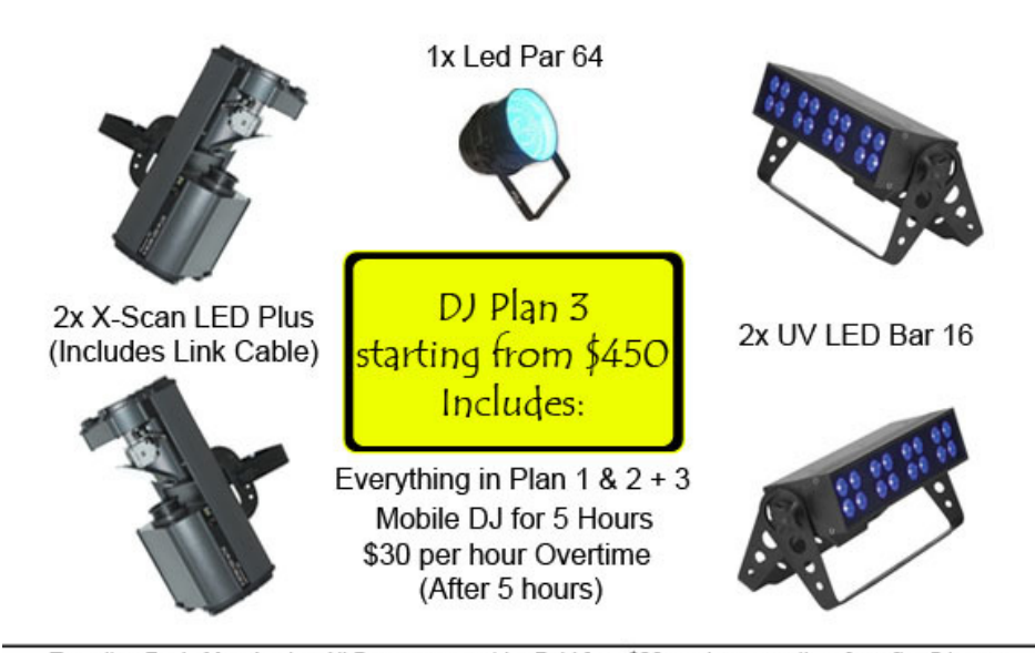
Traveling Fee's May Apply - All Damages must be Paid for - $30 per hour overtime fee after 5 hours

Mobile DJ Plan 3 : starting from $450 for 5 hours includes all in Mobile DJ Plan 1 & 2 + 2x ADJ X-Scan Led Plus, 2x ADJ UV Led Bar 16, 1x Light Emotion Led Par 64, & 1x Lighting Stand Truss with 2x T-Bars ($30 per hour after 5 hours of DJ time, set up & pack up is not charged for)