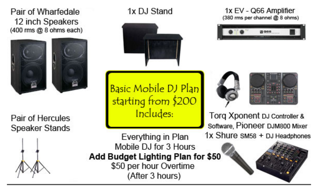
Traveling Fee's May Apply - All Damages must be Paid for - $50 per hour overtime fee after 3 hours