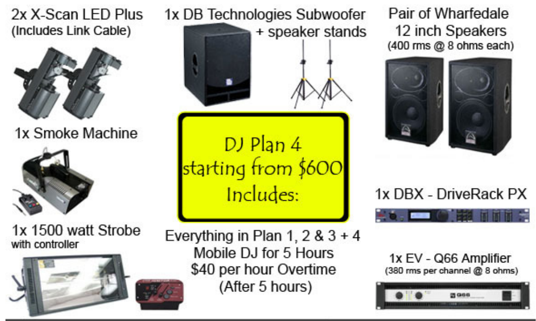
$2 Traveling Fee's May Apply - All Damages must be Paid for - $40 per hour overtime fee after 5 hours

Mobile DJ Plan 4 : starting from $600 for 5 hours includes all in Mobile DJ Plan 1, 2 & 3 + 2x Wharfedale LX 12 400 rms speakers at 129spl, 1x DB Tech Sub15 800 Rms Powered at 129spl, 1x EV Q66 Amp 380rms per channel, Pair of Hercule Speaker Stands, 1x DBX Drive Rack, 2x ADJ X-Scan Led Plus, 1x Light Emotion 1500 watt Strobe with controller, 1x Antari Large Smoke Machine ($40 per hour after 5 hours of DJ time, set up & pack up is not charged for)