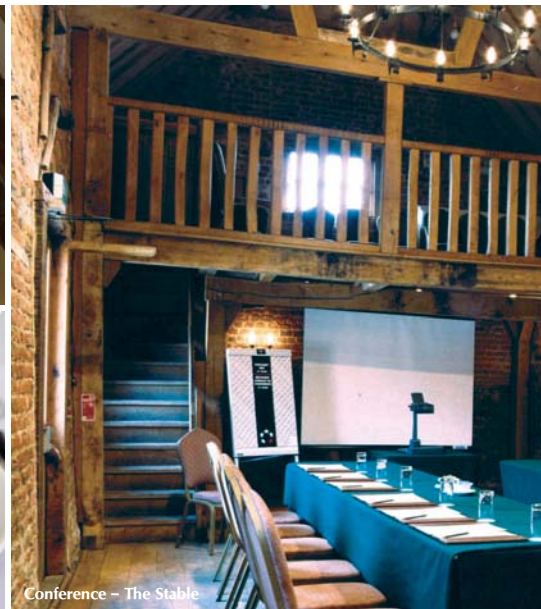
Conference - The Stable