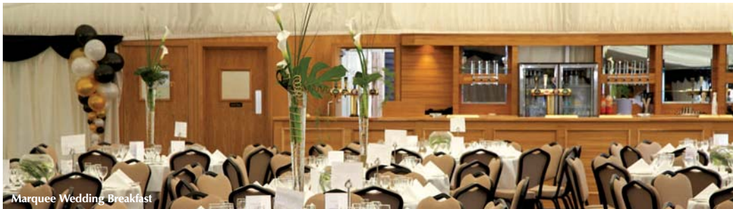
Marquee Wedding Breakfast

The 17th Century Tythe Barn, the delightful red brick Stable Block and our Millstream Suite complete with a pagoda along the river Mimram, are our three wedding venues that can cater for Wedding Ceremonies and Wedding Breakfasts. The Meadow Marquee is the perfect venue for a Wedding Breakfast up to 250 guests.