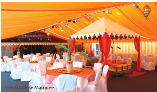
The Meadow Marquee