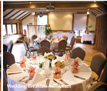
Wedding Breakfast Millstream