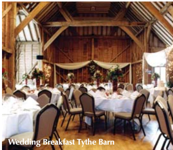
Wedding Breakfast Tythe Barn