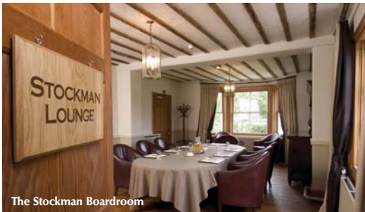
The Stockman Boardroom