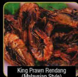
King Prawn Rendang (Malaysian Style)