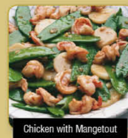
Chicken with Mangetout