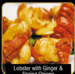
Lobster with Ginger & Spring Onions