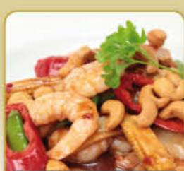
King Prawn with Cashew Nuts