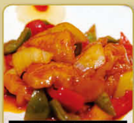
Sweet & Sour Chicken Cantonese Style