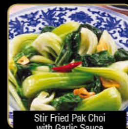
Stir Fried Pak Choi with Garlic Sauce