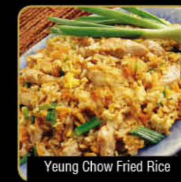
Yeung Chow Fried Rice