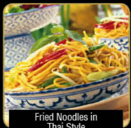
Fried Noodles in Thai Style