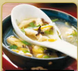
Chicken & Sweet Corn Soup