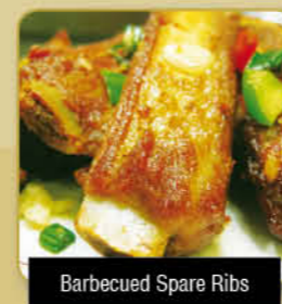
Barbecued Spare Ribs