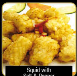
Squid with Salt & Pepper