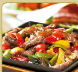
Sizzling Lamb with Black Bean Sauce