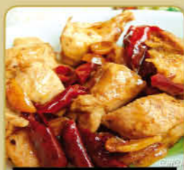
Chicken Peking Style