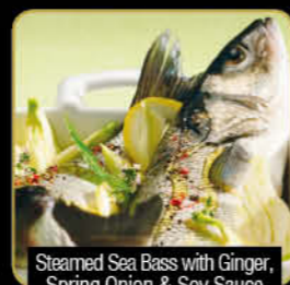
Steamed Sea Bass with Ginger, Spring Onion & Soy Sauce