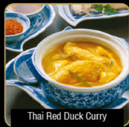
Thai Red Duck Curry