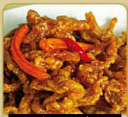
Crispy Beef with Chilli Sauce