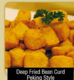
Deep Fried Bean Curd Peking Style