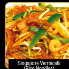
Singapore Vermicelli (Rice Noodles)