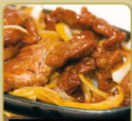
Sizzling Fillet Steak with Black Pepper Sauce