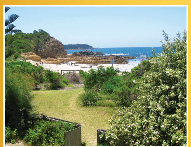
Actual view from the accommodation verandah