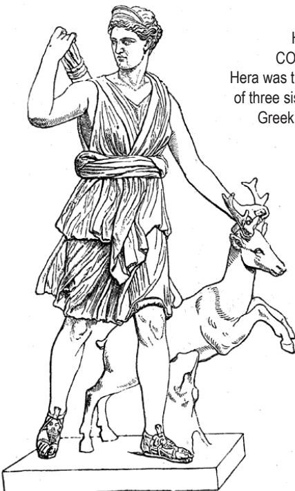
HERA COLOR ME Hera was the wife and one of three sisters of Zeus in Greek Mythology.