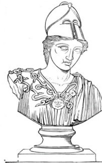
GREEK STATUE COLOR ME