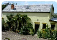
2on2 & Corindas

http://www.huonvalleyescapes.net/port-huon-cottages.html