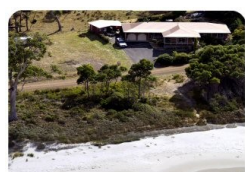
Roaring Beach retreat

http://www.huonvalleyescapes.net/buttongrass-retreat.html