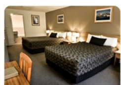
THE OLD WOOLSTORE

http://www.huonvalleyescapes.net/corindas-and-2-on-2.html