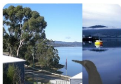
Port Huon cottages and ecocruise

http://www.huonvalleyescapes.net/huon-bush-retreats.html