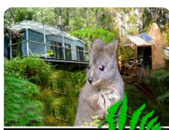
huon bush retreats

http://www.huonvalleyescapes.net/port-huon-cottages.html