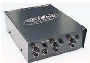
HPA-2 2 Channel Headphone Amplifier