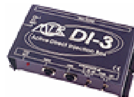
DI-3, DI-2 Active DI Boxes