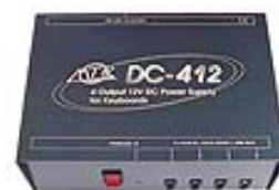
DC-8DUAL, DC-412 Keyboard Power Supplies