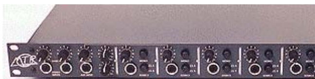
HPA-6 6 channel Headphone Amplifier