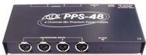
PPS-48 4 ch 48v Phantom Power Supply