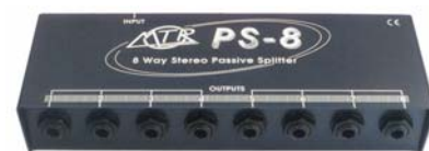
PS-4, PS8, PS-4v, PS-8v Passive Splitters