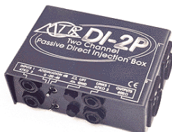
DI-1 & DI-2P Passive D.I. Boxes