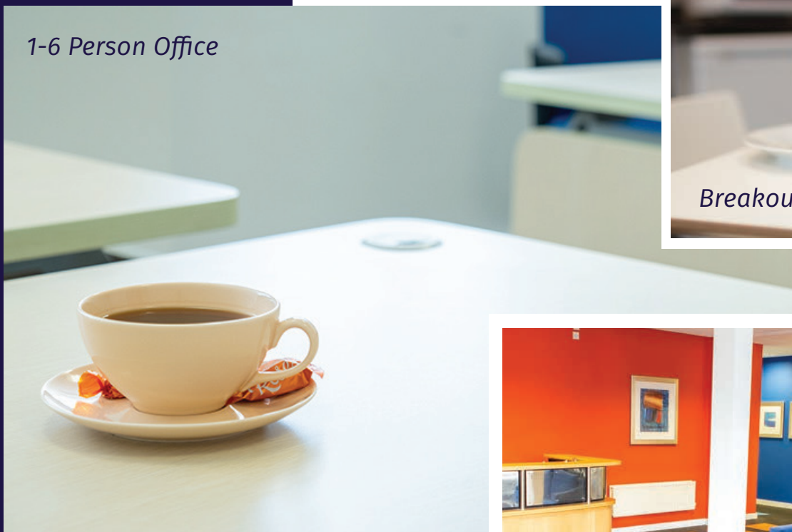
1-6 Person Office

Alternatively, we offer various Virtual Office packages for those who require a professional business presence without the need for a physical office space. Bringing together people, property and technology, providing you with the tools to allow your business to grow.