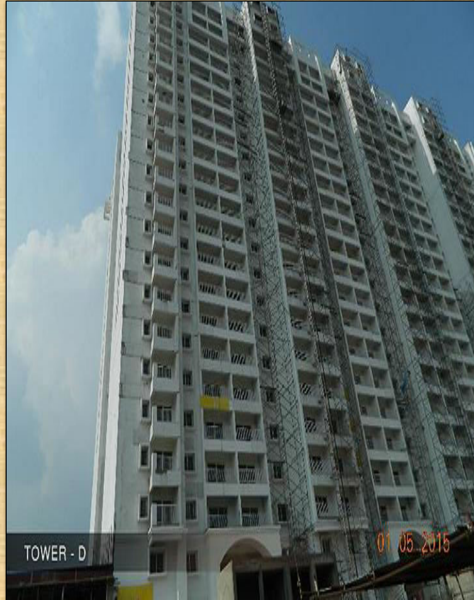
TOWER - D