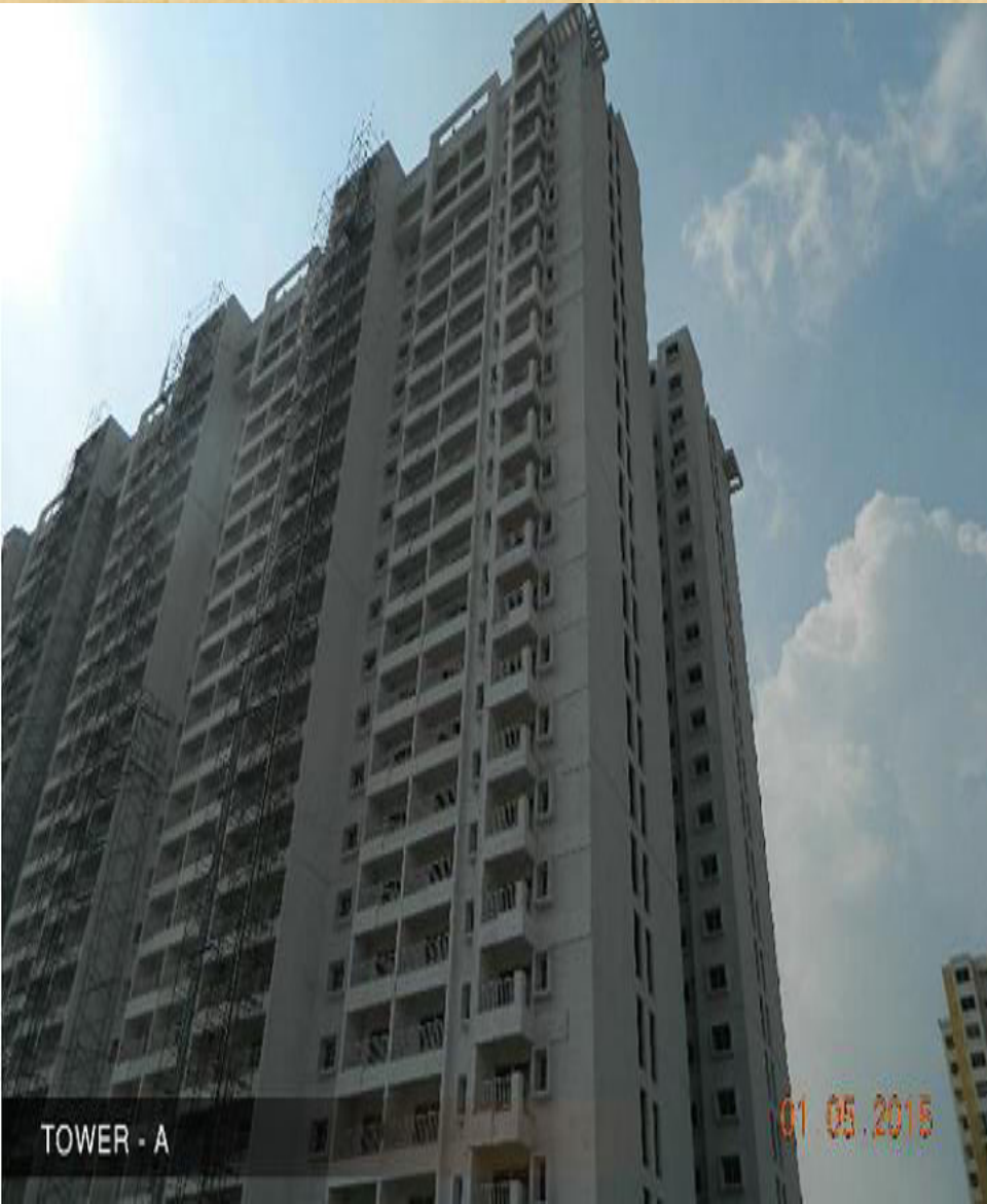
TOWER - A