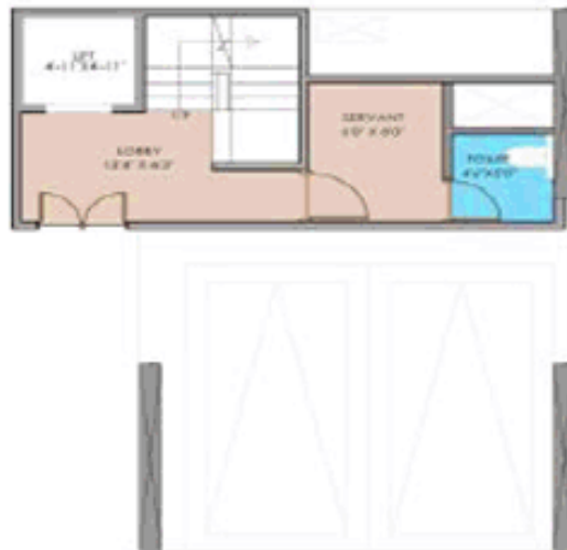
DRIVEWAY 6.0 M WIDE BASEMENT FLOOR PLAN