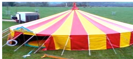
"Rhubarb and Custard"

Grassed Area Needed for stakes & guy ropes