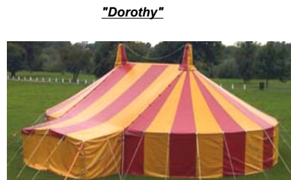
Above showing 1.5 x 6m foyer