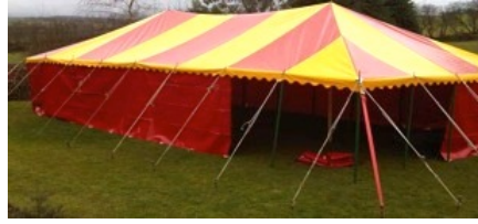
"Long & Shorty"