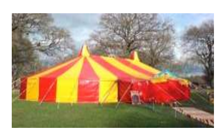
Above showing opposite 3 x 6m foyer

17m dia 95sqm 180 60-80 red/yellow £200 50 ft. 962 sq. ft. or solid red 8 tables or window