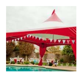
pagodas can be made in almost any colour. advance notice required.