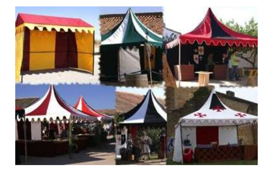
medieval tents mostly 3x3m...many colours available special requests require notice.