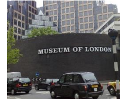
museum of London

*all with in a 5 minute walk from 20 Little Britain