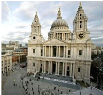
St. Pauls Cathedral