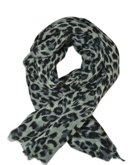
Grey leopard print scarf €89.00