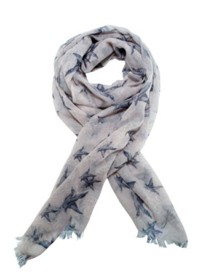
Paisley scarf with bird motif in grey and pastel pink €99.00

Size: 70 x 180 cm Material: 100% soft virgin wool. Colour: Emerald green, light grey and anthracite grey. Care: Dry clean only.