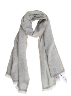
Light grey scarf in 100% cashmere €199.00

Size: 52 x 190 cm Material: 100% lambswool. Colour: Light blue melange and taupe. Care: Dry clean only.