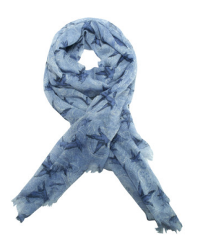
Paisley scarf with bird motif in grey and blue €99.00

Size: 70 x 180 cm Material: 100% soft virgin wool. Colour: Pink, light grey and anthracite grey. Care: Dry clean only.