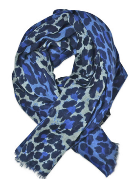
Blue leopard print scarf €89.00

Size: 70 x 180 cm Material: 100% wool. Colour: Dark blue, bright blue, indigo blue and off-white. Care: Dry clean only.