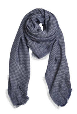
Marine blue scarf in beautiful quality €99.00

Size: 120 x 120 cm Material: 50% modal (natural) and 50% cotton. Colour: Black and grey. Care: Dry clean only.