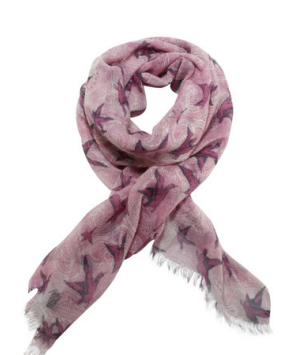
Paisley scarf with bird motif in grey and pink €99.00

Size: 70 x 180 cm Material: 100% soft virgin wool. Colour: Pastel pink, light grey and anthracite grey. Care: Dry clean only.