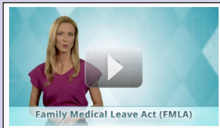
Family and Medical Leave Act