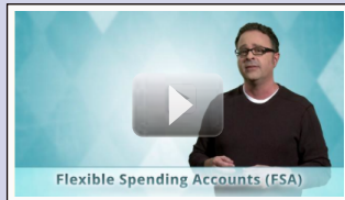
Flexible Spending Accounts