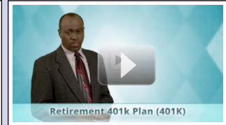
401K Retirement Plans