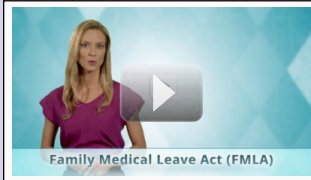
Family and Medical Leave Act