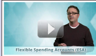
Flexible Spending Accounts