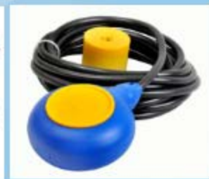
Cable Float Switch