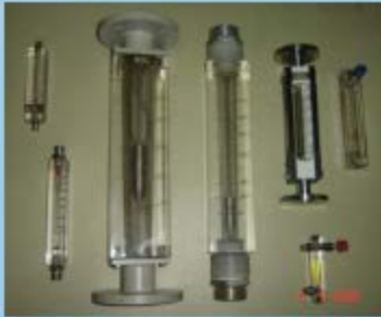
PTFE Lined/Acrlic body Glass Tube Rotameter