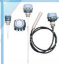
Vibrating Fork Level Limit