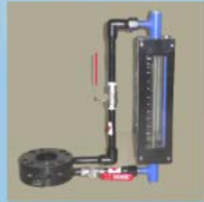
Bypass Rotameter for Mass flow Rate