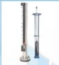
Top Mounted Magnetic Indicator