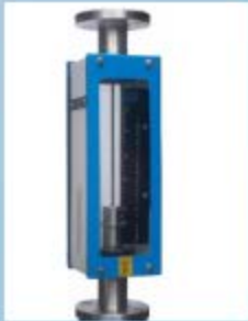
Glass Tube Rotameter /Glass tube Purge Type