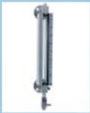
Tubular Type level Indicator