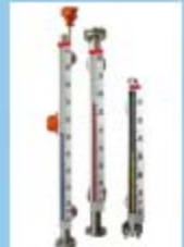
Transparent Type level Indicator