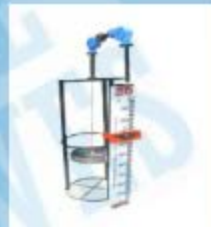
Float & Board Type level Indicator