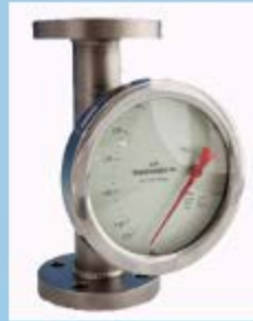
Metal Tube Rotameter