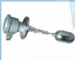
Side Magnetic Float Switch