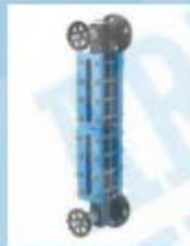
Reflex Type Level Indicator