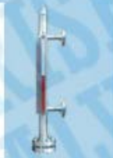
Top/Side Mounted level Indicator