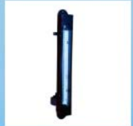
Glass Tube Manometer