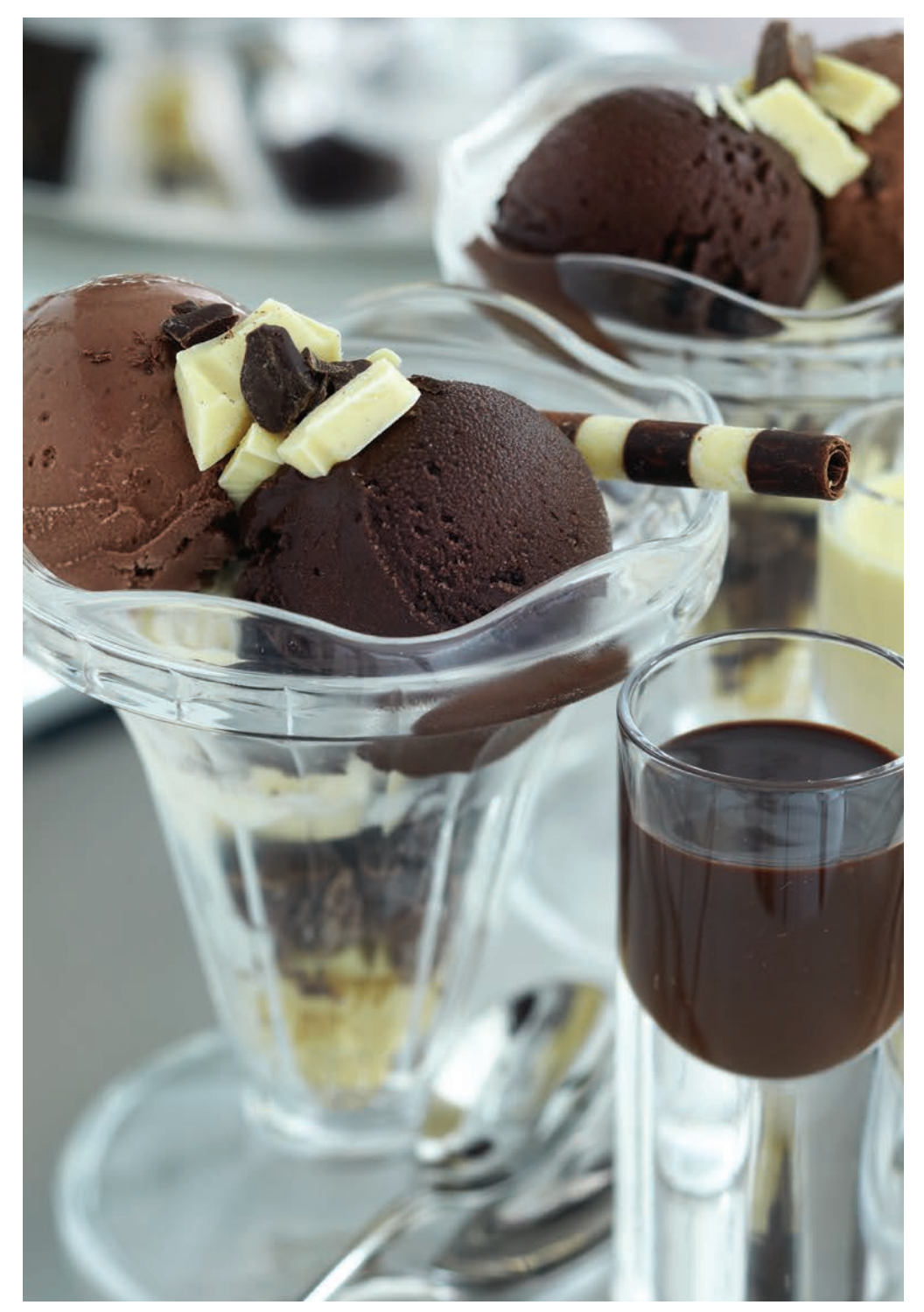
LOVE CHOCOLATE £7.80 Milk, dark and white chocolate gelato, chocolate chunks and your choice of milk or white chocolate sauce.