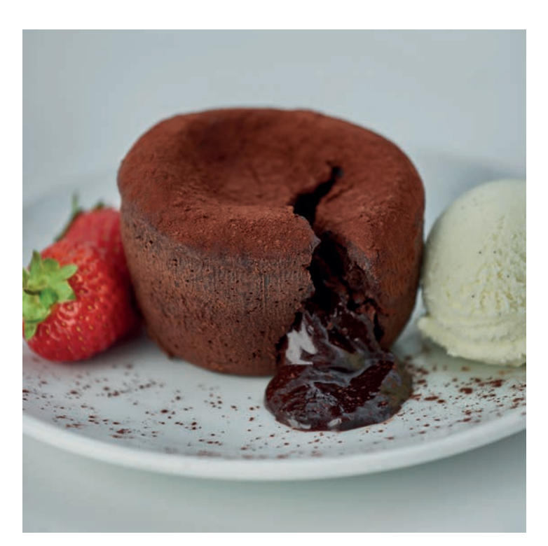
CHOCOLATE FONDANT CAKE £6.50

Chocolate sponge with a rich warm lava centre, served warm with a scoop of your favourite gelato.