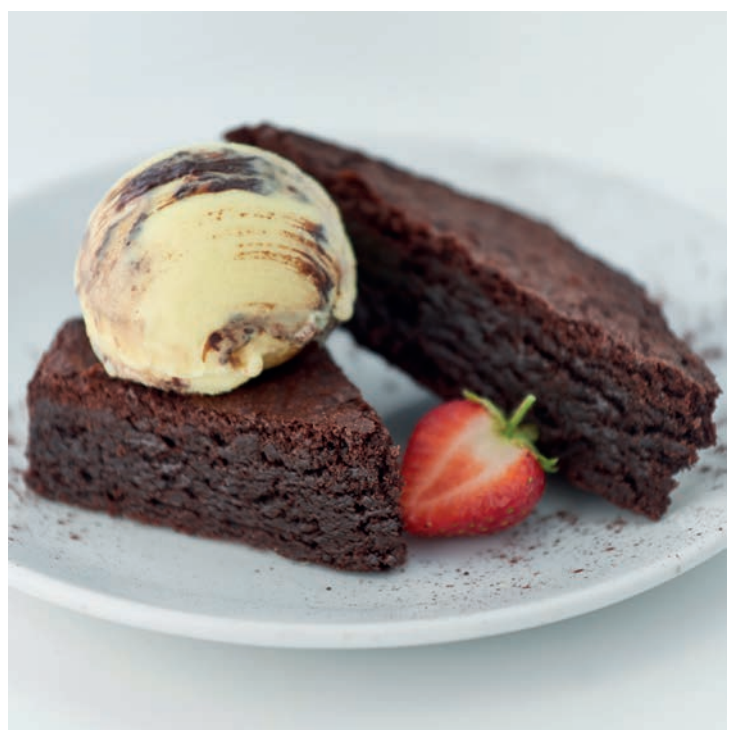
CHOCOLATE BROWNIE £6.50 A deliciously moist, warm chocolate brownie served with your choice of gelato.

Chocolate sponge with a rich warm lava centre, served warm with a scoop of your favourite gelato.