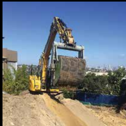
Site Remediation & Site Cleaning