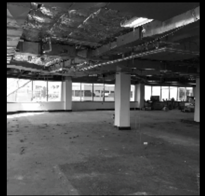
Make Goods & De-fits