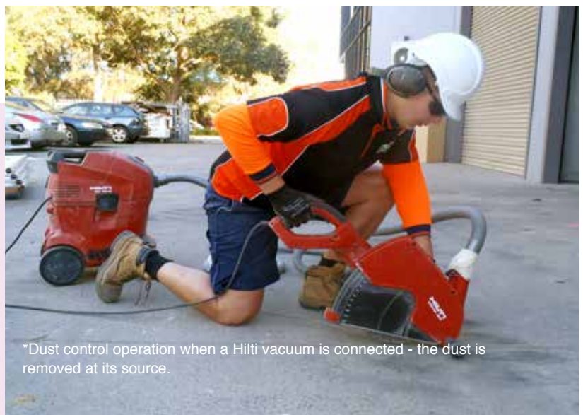
*Dust control operation when a Hilti vacuum is connected - the dust is removed at its source.

From a single core hole to major demolition work, we provide electric and petrol-powered concrete cutting and coring tools for commercial projects and large-scale industrial jobs.