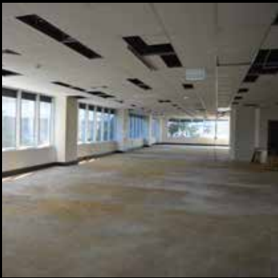
Detail Demolition & Stripouts