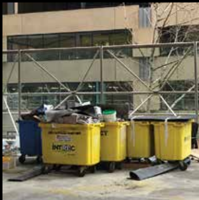
Waste & Rubbish Removal