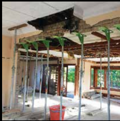
Emergency Make Safes