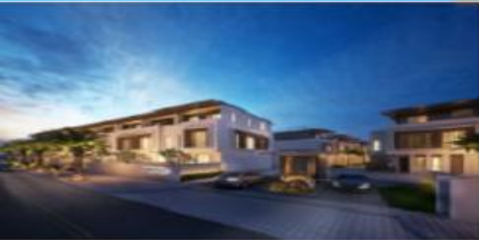
BHK Apts Starting Rs. 2.4 Crore