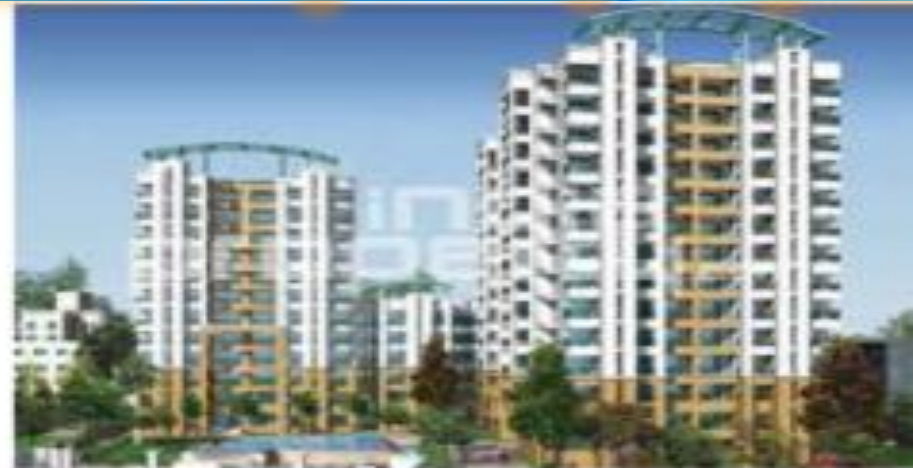
1.5 / 2 BHK Apts Starting Rs. 1.3 Thousand