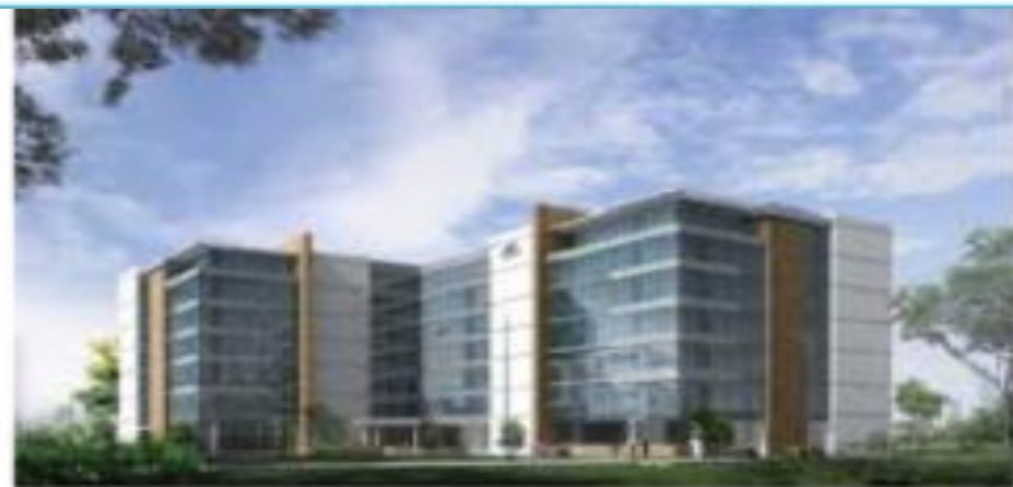
1.5 / 2 BHK Apts Starting Rs. 42 Lakh