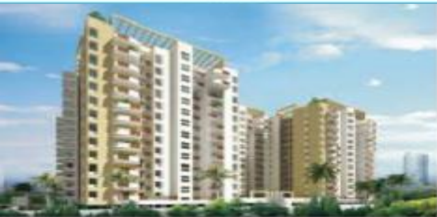
1.5 / 2 BHK Apts Starting Rs. 42 Lakh