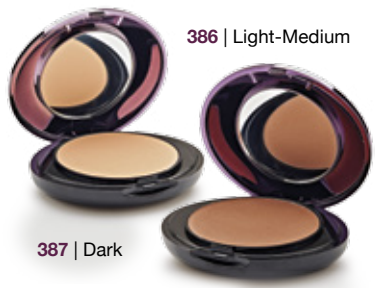
386 | Light-Medium