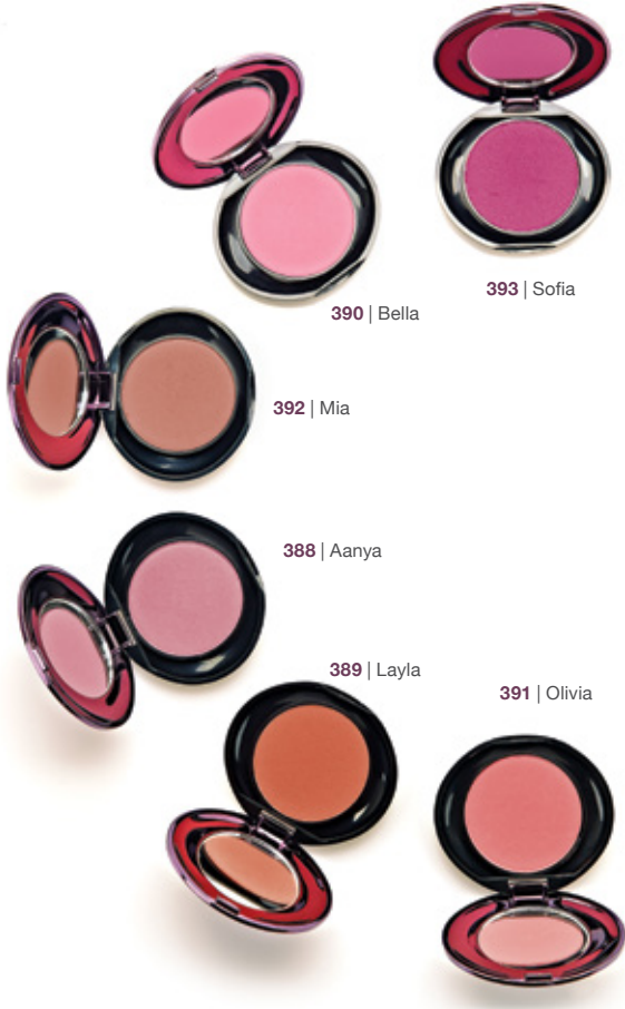
390 | Bella