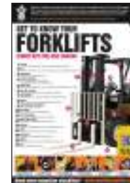
Forklift Code: 51360 £18.63 ex vat