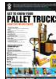
Pallet Truck Code: 51364 £18.63 ex vat