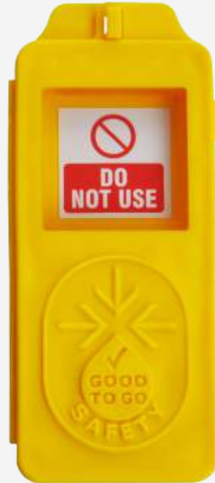
1 - ACTUAL SIZE