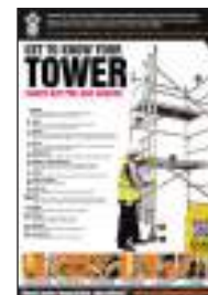
Scaffold Tower Code: 51363 £18.63 ex vat