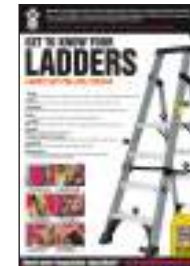
Ladder Code: 51361 £18.63 ex vat