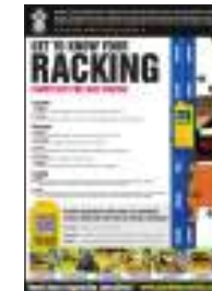
Racking Code: 51362 £18.63 ex vat